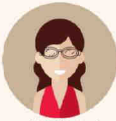
Fake ID Card