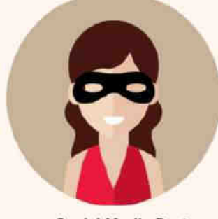
Social Media Post